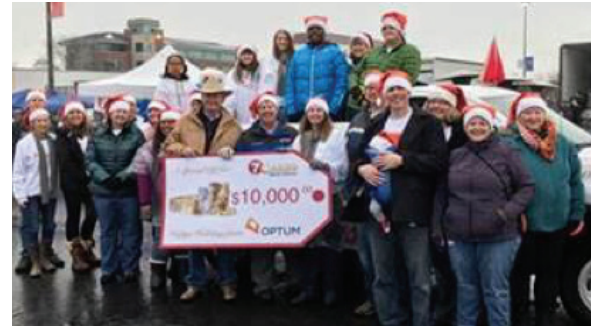
7Cares Idaho Shares day in Boise, Idaho